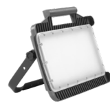
Magnum MultiBattery M