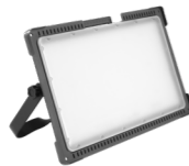
Magnum MultiBattery L