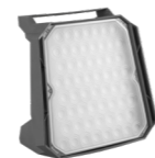
Magnum MultiBattery XS